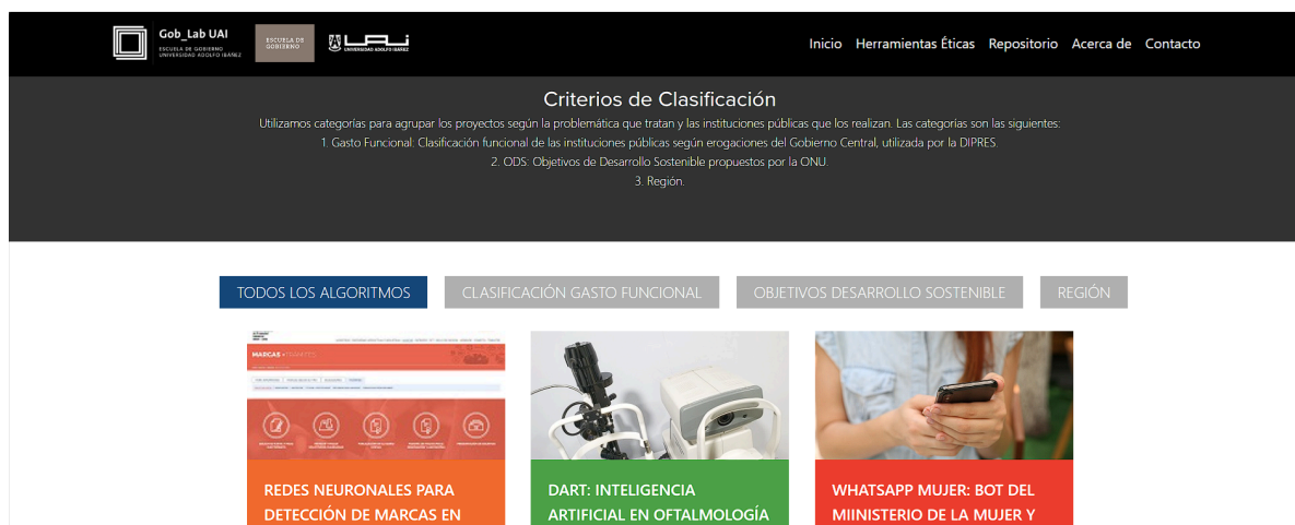
Figure 1: Algoritmos públicos homepage