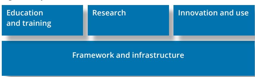
Figure 1. Key conditions for use of AI in Sweden.

The purpose of this national approach is to identify some of the most important conditions for societal stakeholders to manage together in relation to AI. For Sweden to reap the benefits of AI, all sectors of society must be involved; this is not an issue that the state, municipalities, county councils, academia or private companies can deal with on their own.